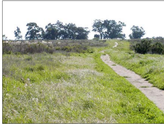
Map to More Mesa Beach and the mile-long path across the mesa above.

Local residents are noticing a growing influx of college- and high-school-age people over the last two years, tromping toward the bluff's edge and then navigating a rocky trail down to the caves, hauling logs for campfires and coolers filled with food and drinks. The caves are tall enough to stand in and roomy enough for campers to build fires and drink beer. Some draw graffiti on the large boulders that form the caves' jagged mouths. Residents of Hope Ranch have long complained that the unwelcome visitors trespass on their property and climb over their fences to gain access to the three caves carved into the sandstone bluff rising above the Pacific.