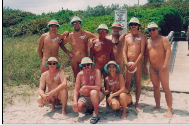
(l-r): Beach Ambassadors at Black's Beach in California and at Haulover Beach in Florida