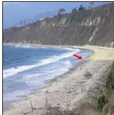
Bates (North Rincon) Beach

Current Status: Local nudists are currently working to restore Bates for nude use. At present, it is not considered safe for nudity, but deputies only come down periodically. Go as far north as possible, north of the concrete barrier to be reasonably safe. Read this "Current Bates News" link for the latest information: